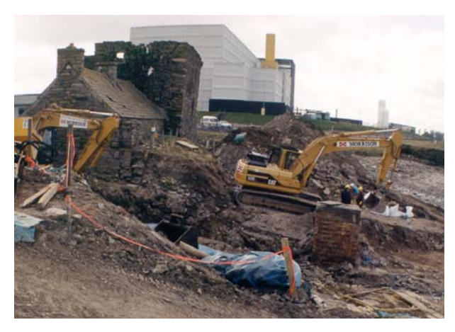
Figure 3 Beginning the remediation of Dounreay Castle

In close co-operation with a specialist archaeological contractor, the ground around the Castle was carefully excavated in slices of 20cm depth. This method allowed the safe removal of contaminated material and a detailed recording of the site archaeological history. The initial stage of the remedial works is shown in Figure 3. Remediation works completed during 1998 allowed open access to the site for the first time in 40 years (Figure 4).