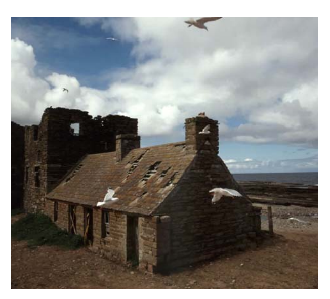
Figure 4 Dounreay Castle after remediation